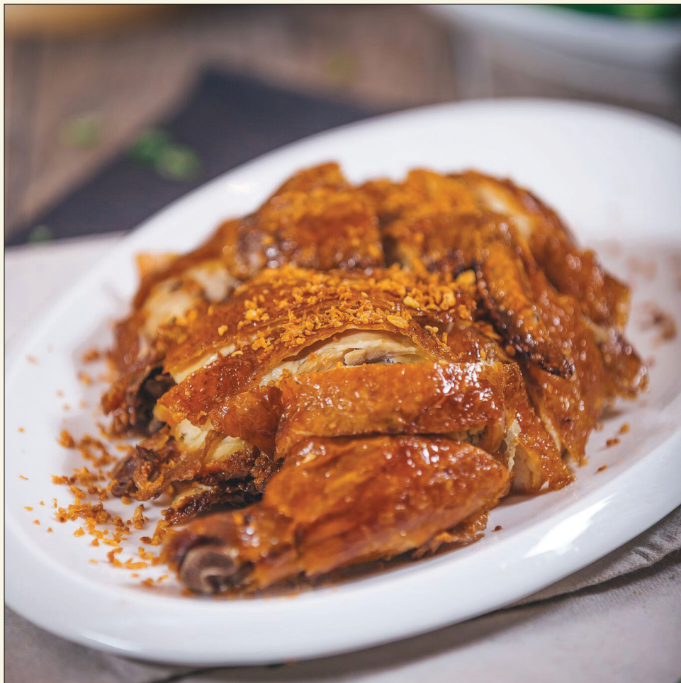
D71 | MaMa's House Fried Chicken [Half] 清風酥雞 [半只]