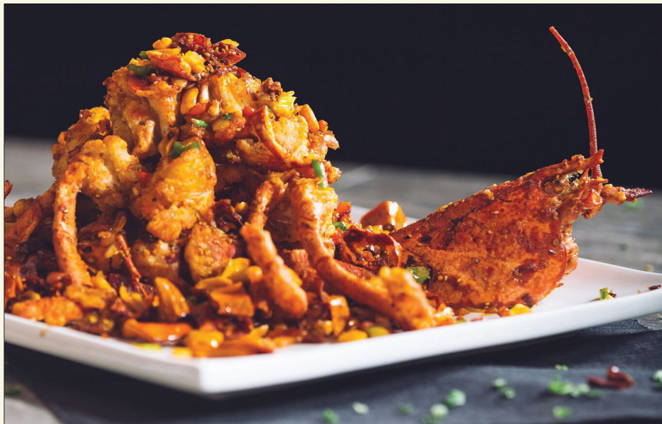
D41 | Hong Kong Style Live Lobster 避風塘龍蝦

🌿 Vegetarian 🌶️ Spicy 🥜 Nuts AAA Premium MP Market Price