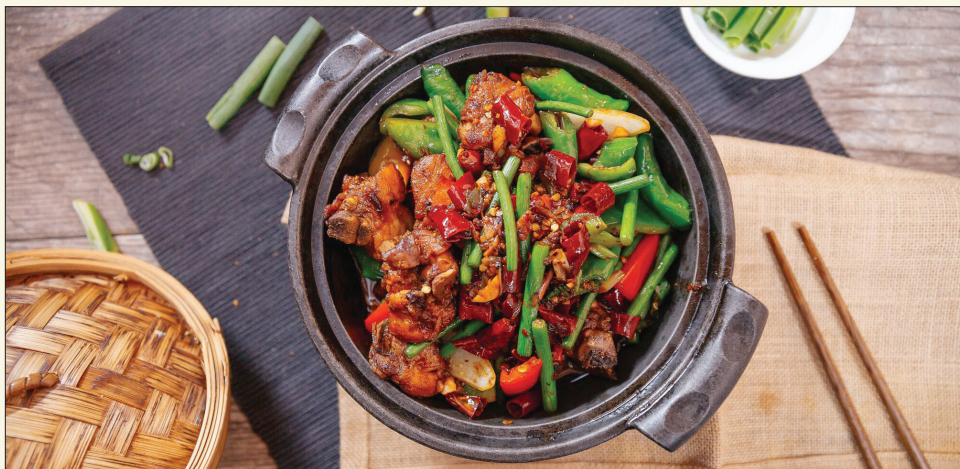
D149 | Chongqing Style Griddle Cooked Chicken 重慶干鍋雞