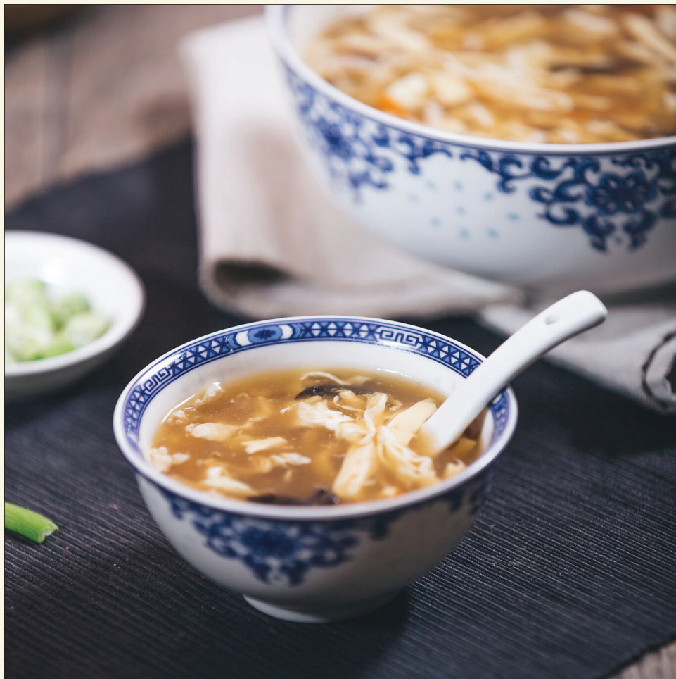
D25 | Chicken Hot and Sour Soup 酸辣湯