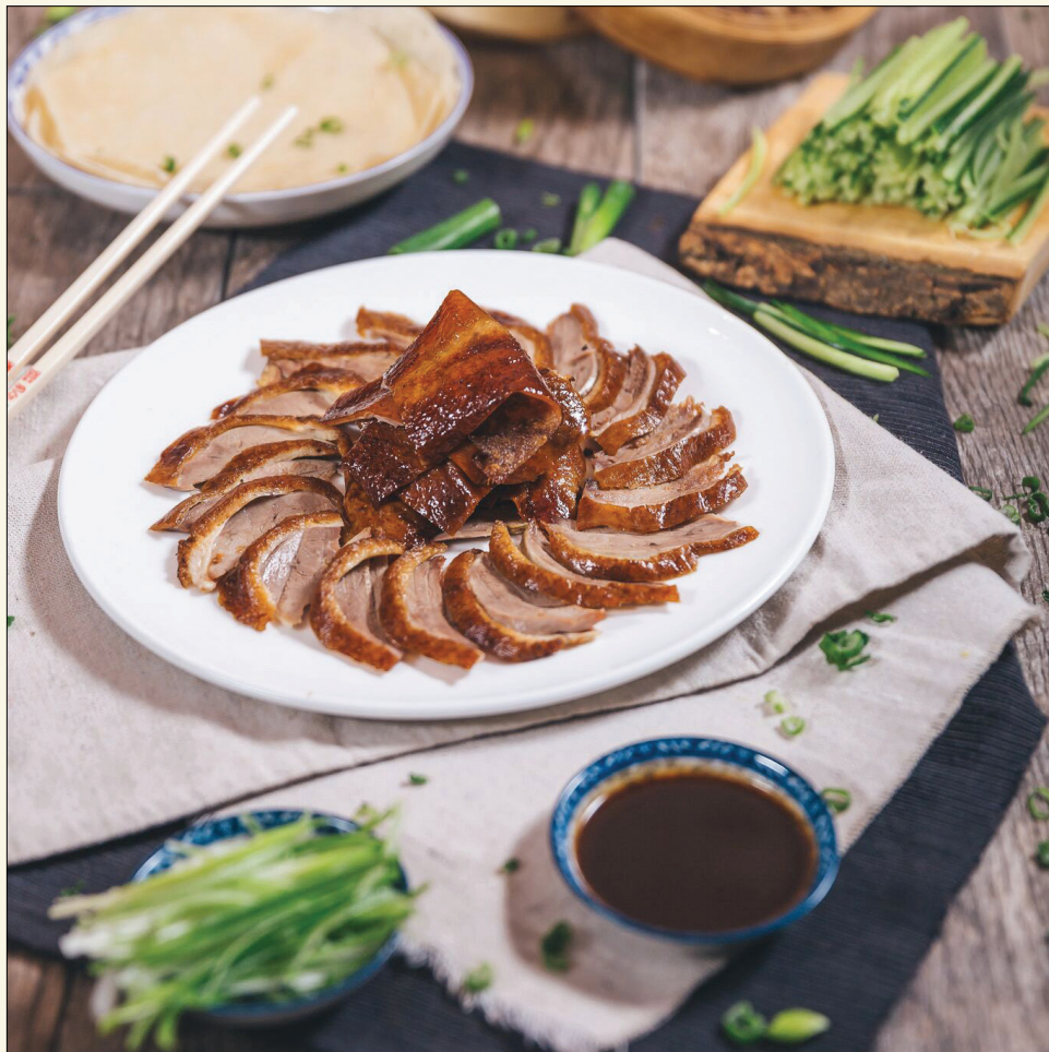
D82 | Peking Duck Combo 金牌北京烤鴨